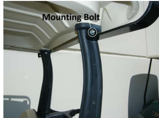
Step 3 Club Car Precedent Installations ONLY

Note: Rear roof mounting brackets have a higher mounting position than the front roof rack mounting brackets.